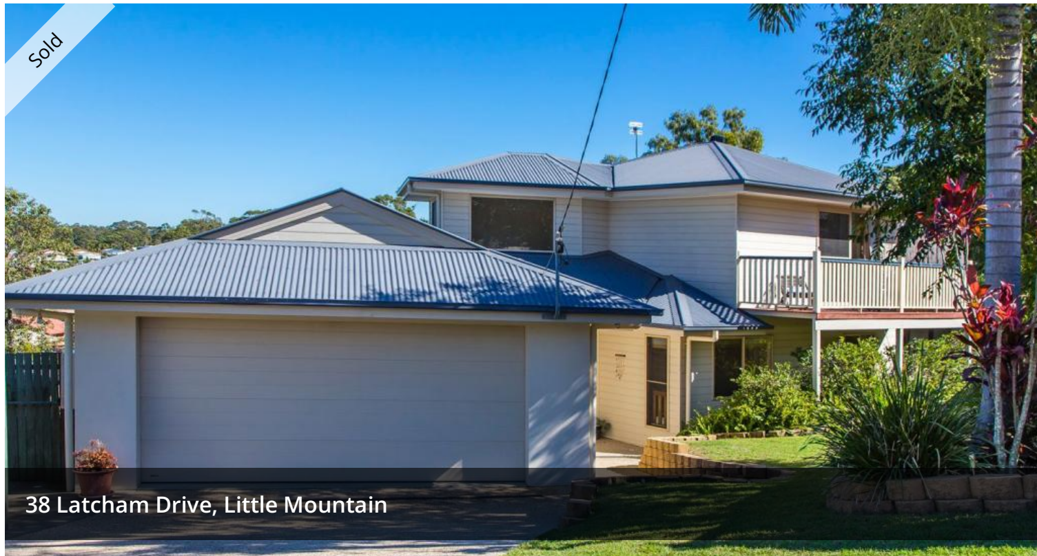
38 Latcham Drive, Little Mountain