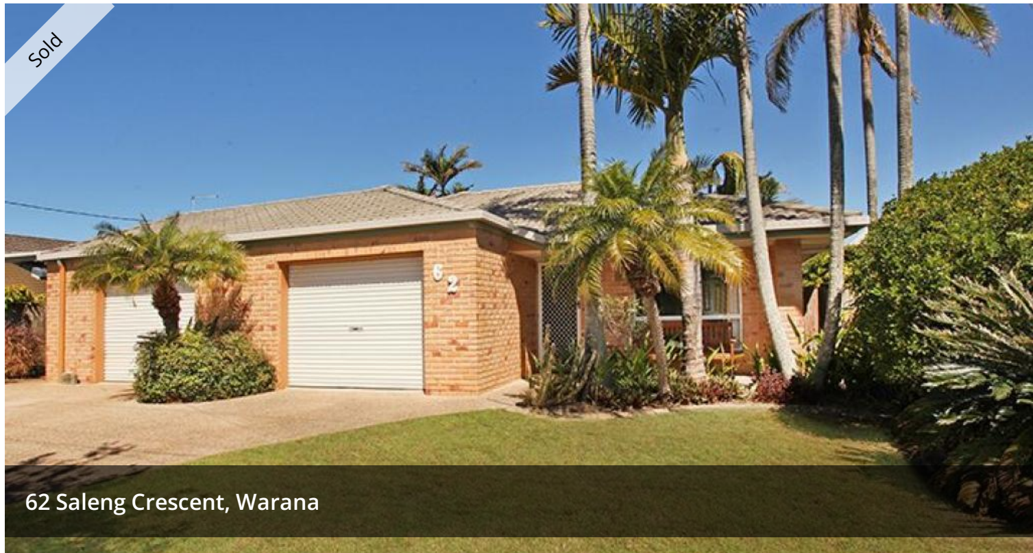
62 Saleng Crescent, Warana