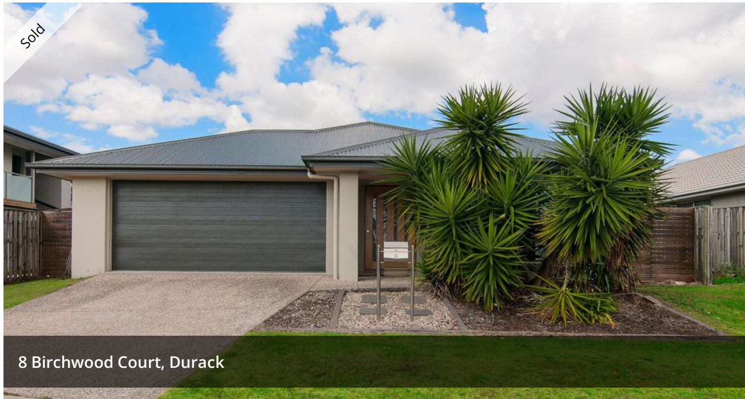
8 Birchwood Court, Durack