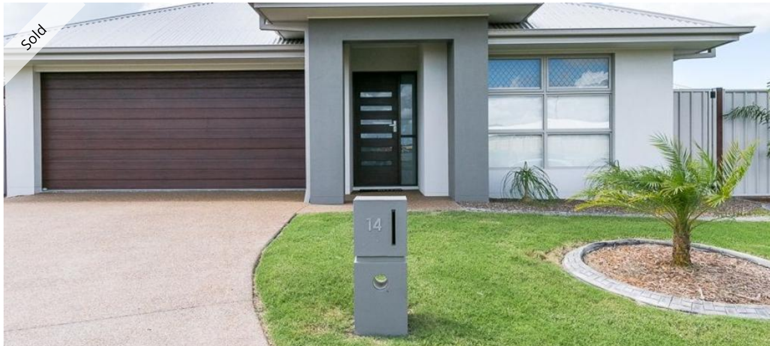
14 Seahaven Circuit, Pialba