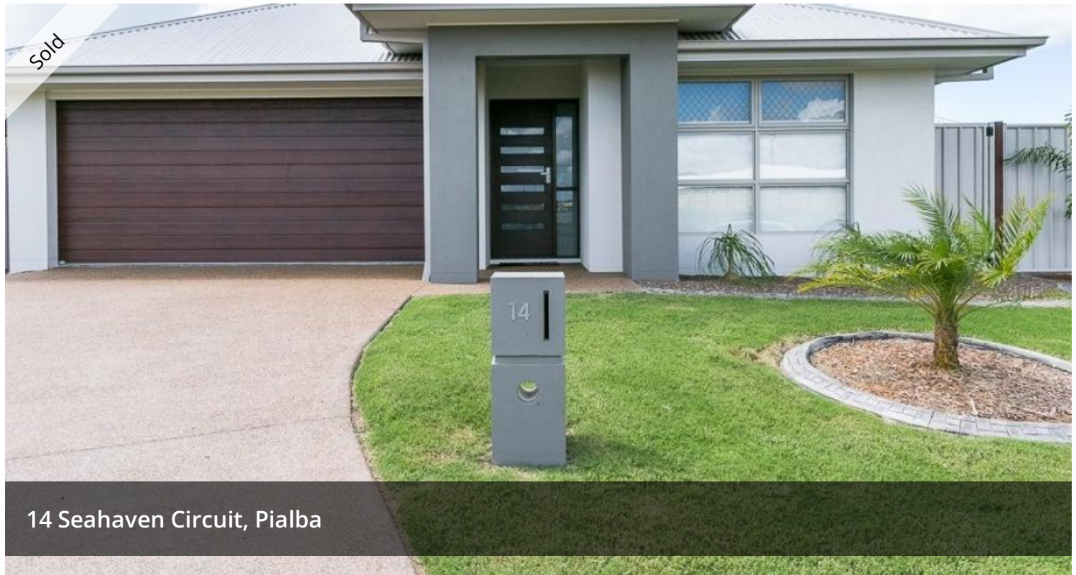
14 Seahaven Circuit, Pialba