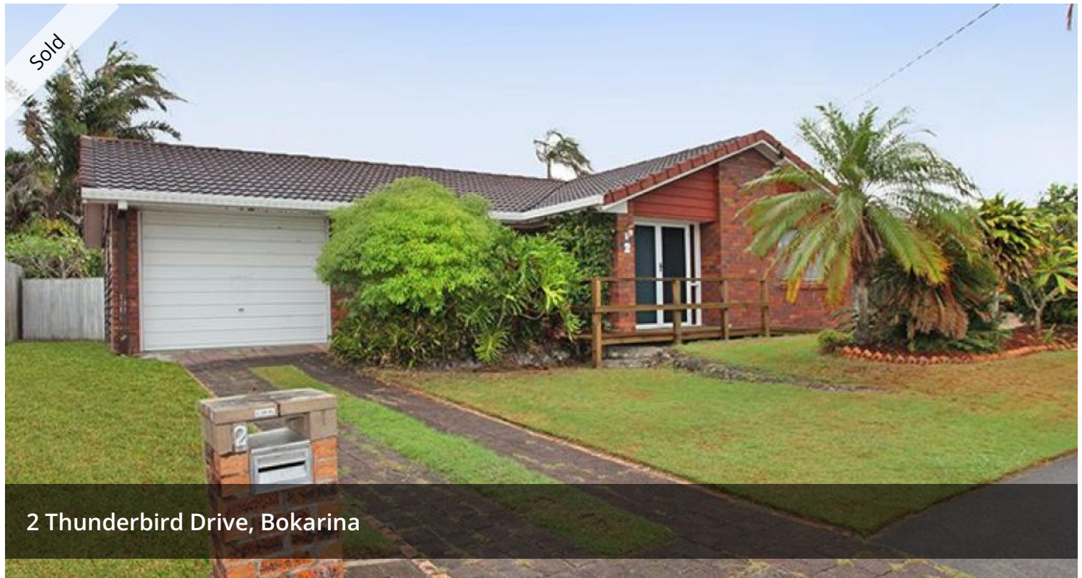
2 Thunderbird Drive, Bokarina