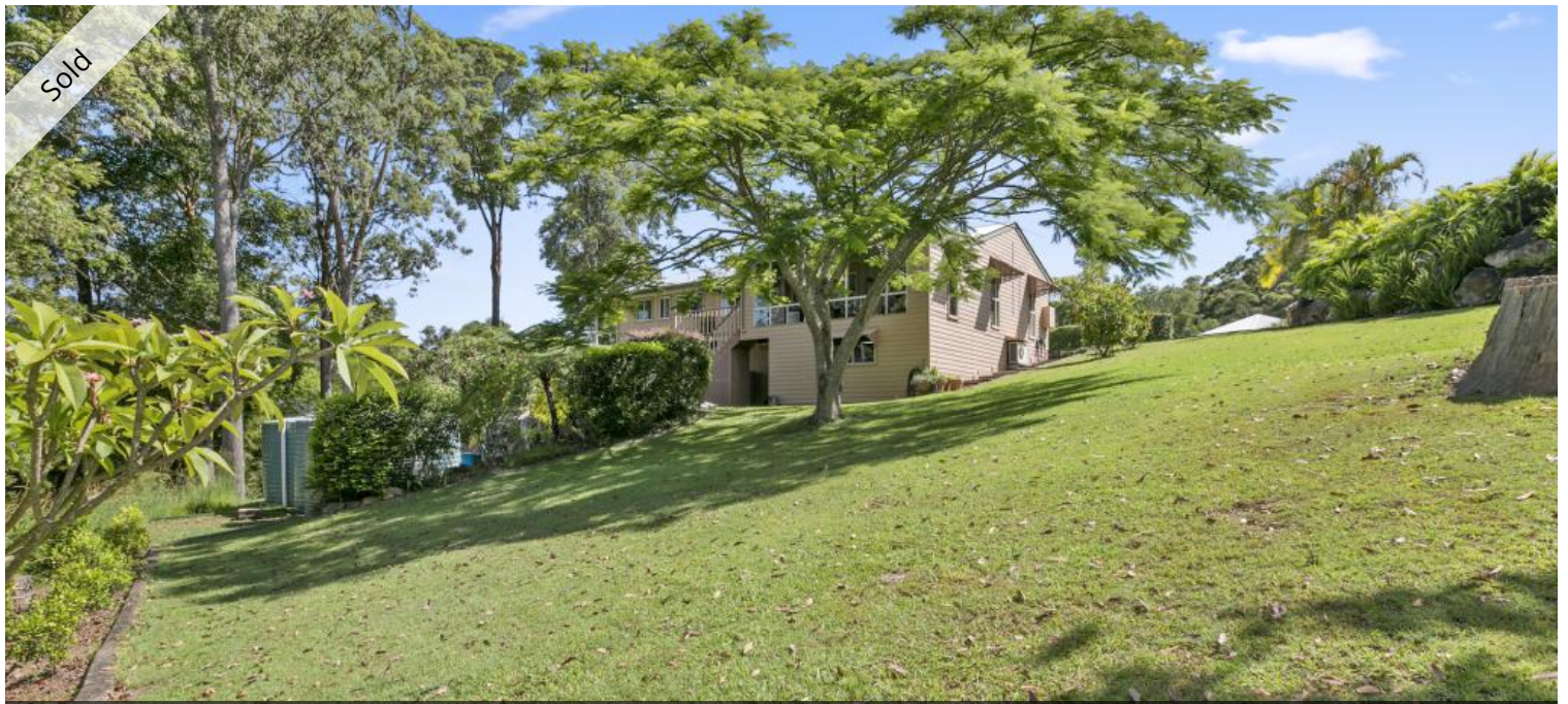
31 Leigha Place, Kureelpa