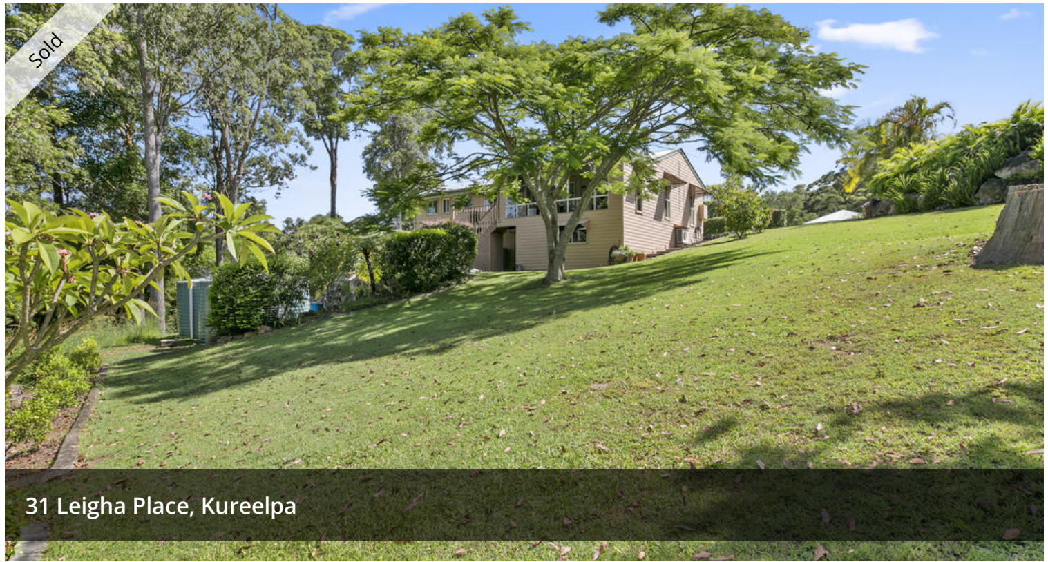
31 Leigha Place, Kureelipa