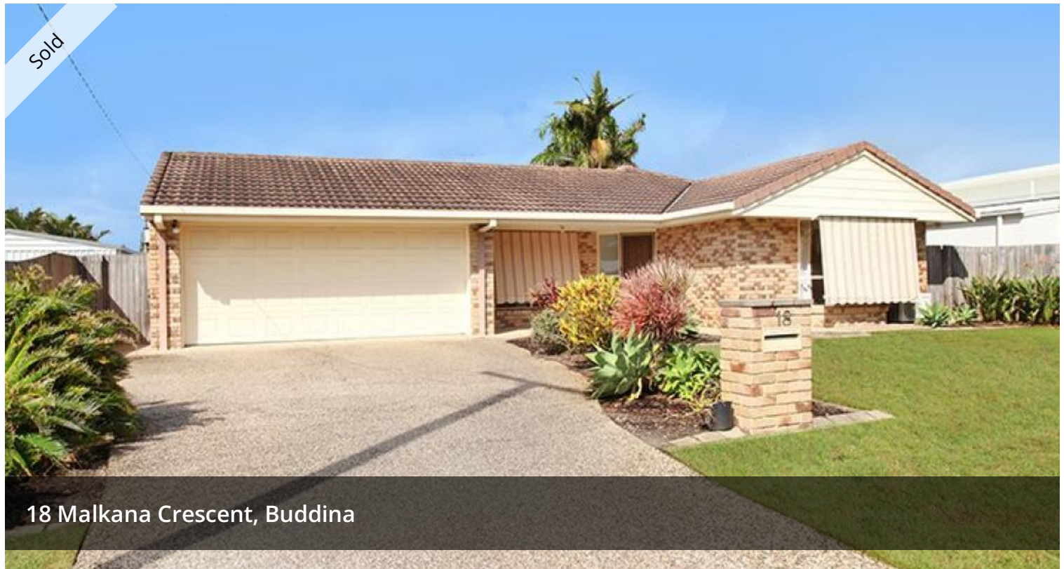
18 Malkana Crescent, Buddina