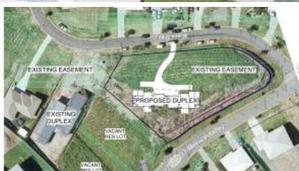
OVERALL SITE PLAN