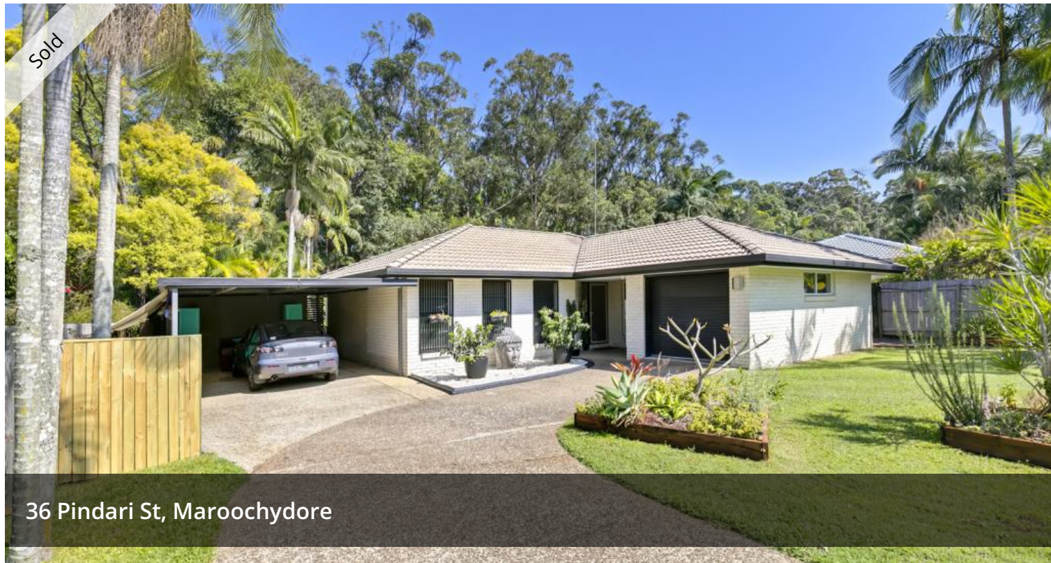
36 Pindari St, Maroochydore