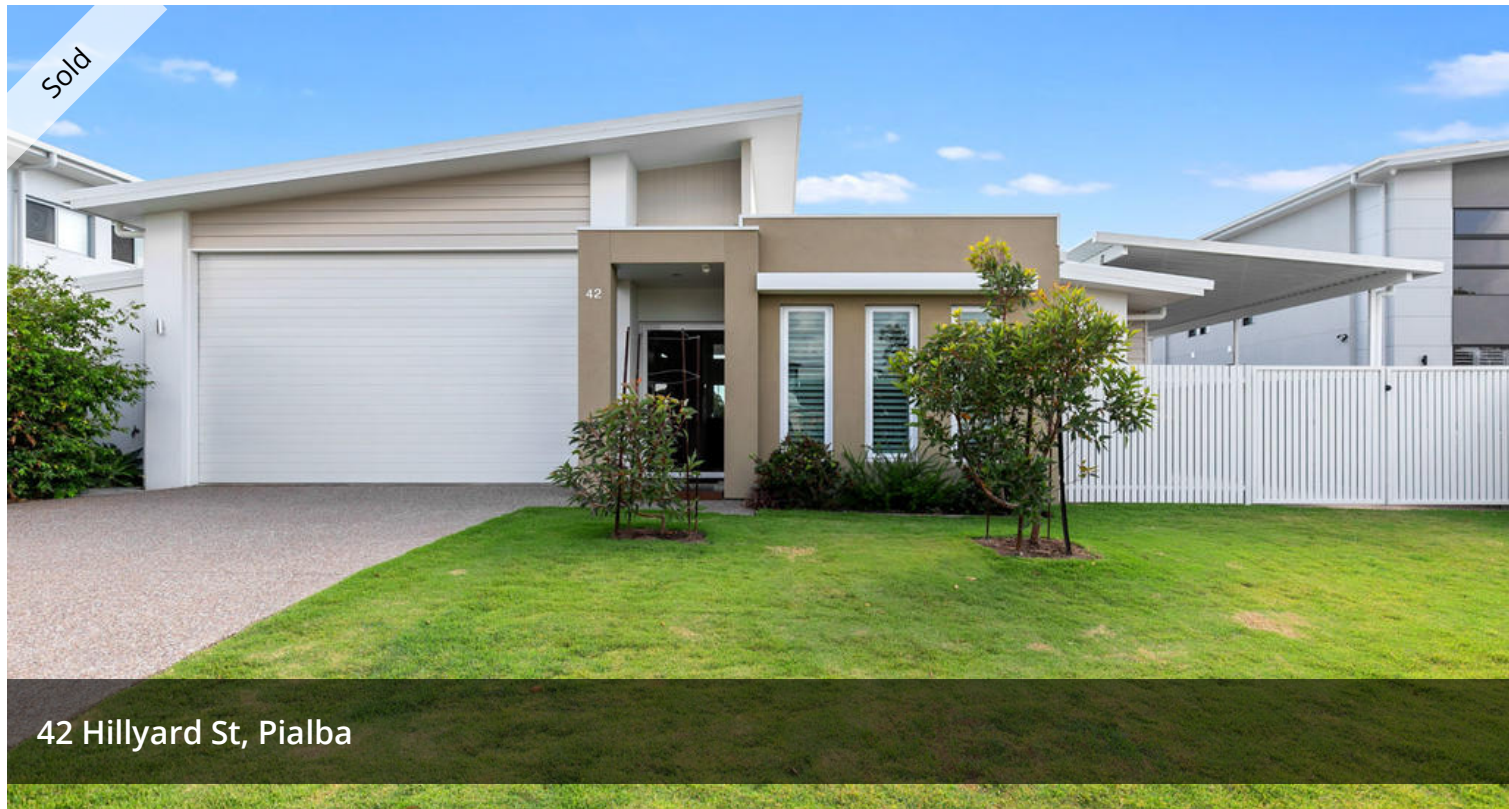
42 Hillyard St, Pialba