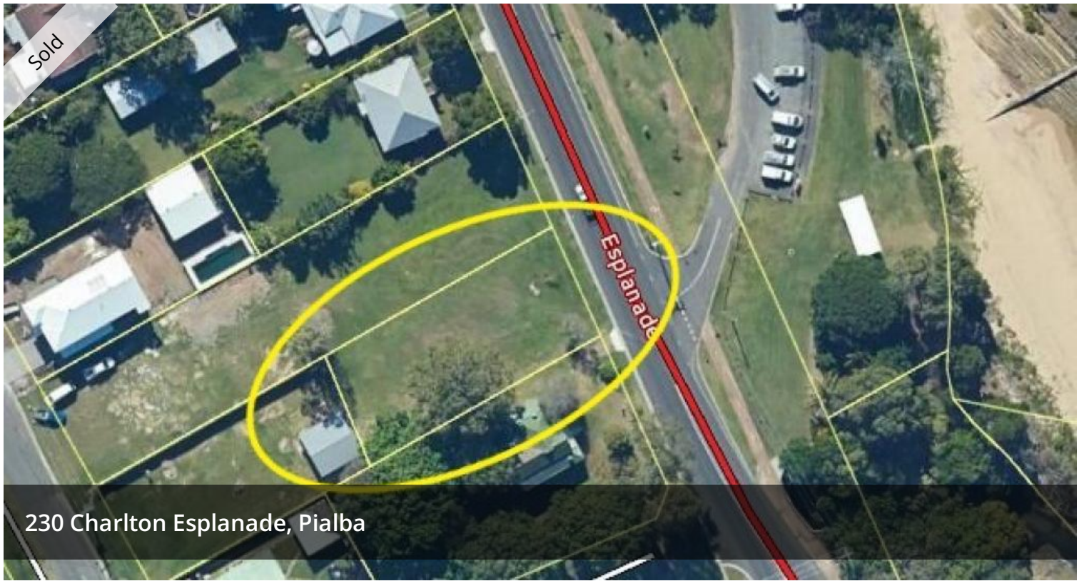
230 Charlton Esplanade, Pialba