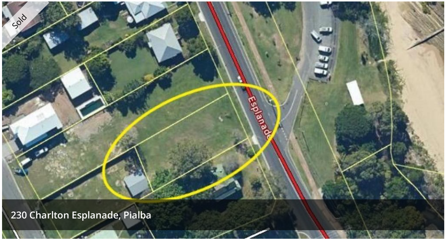
230 Charlton Esplanade, Pialba