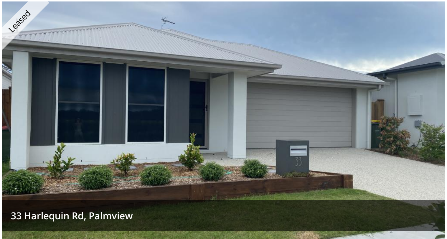
33 Harlequin Rd, Palmview