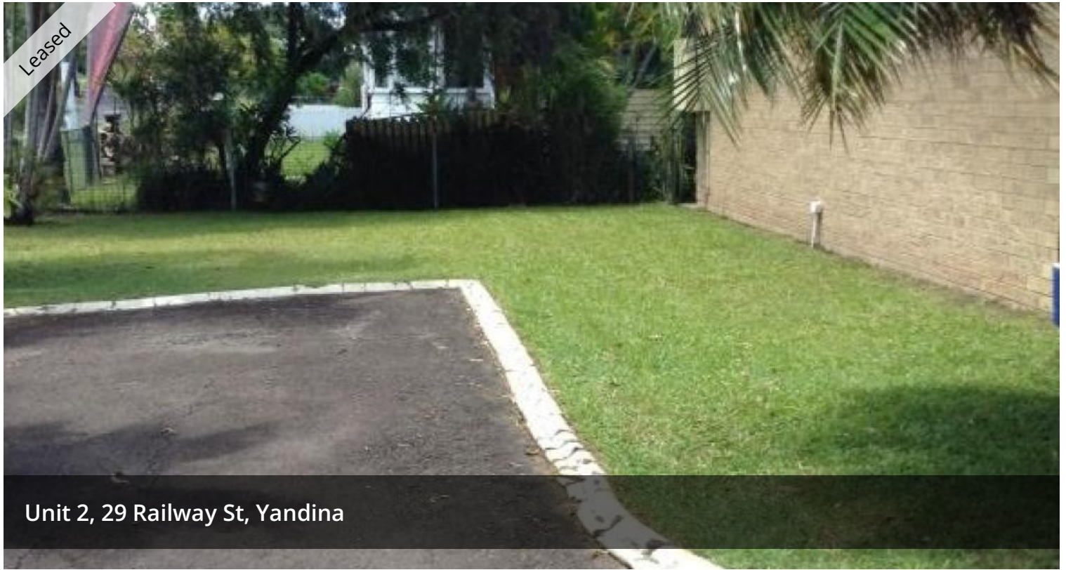
Unit 2, 29 Railway St, Yandina