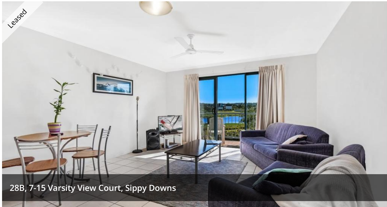
28B, 7-15 Varsity View Court, Sippy Downs