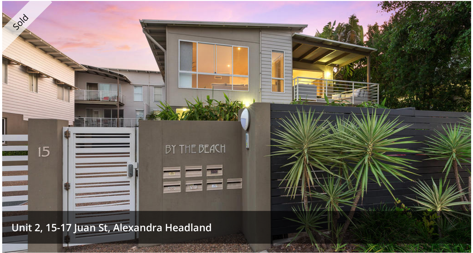
Unit 2, 15-17 Juan St, Alexandra Headland