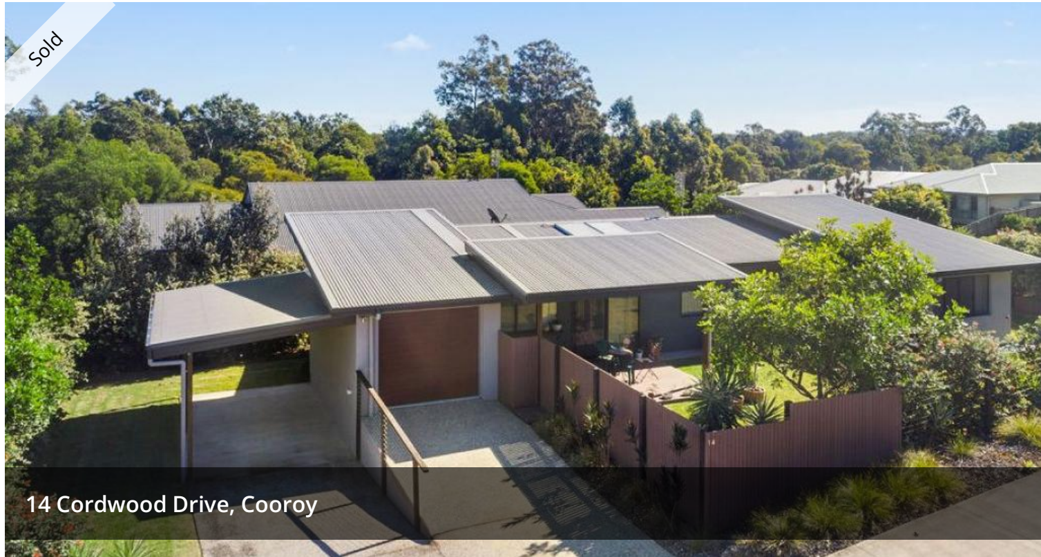
14 Cordwood Drive, Cooroy