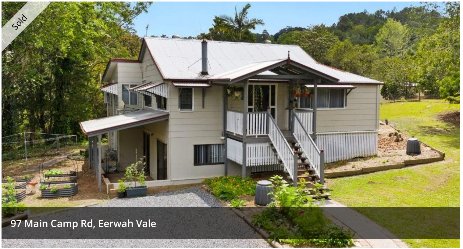
97 Main Camp Rd, Eerwah Vale