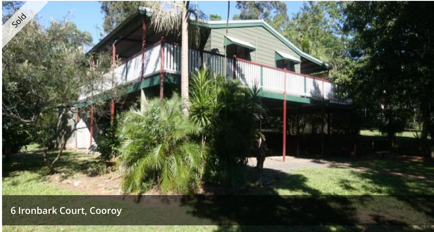
6 Ironbark Court, Cooroy