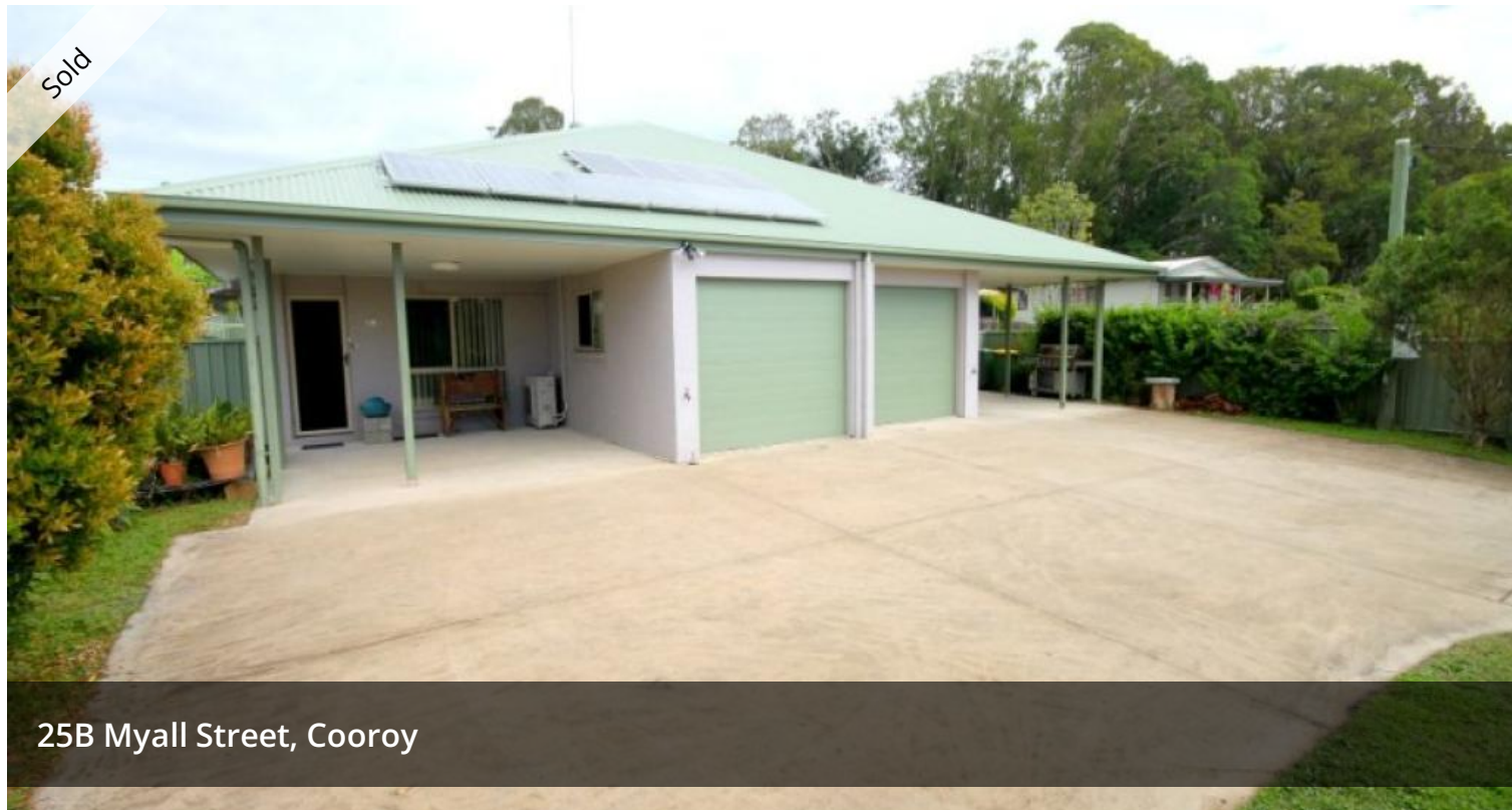
25B Myall Street, Cooroy