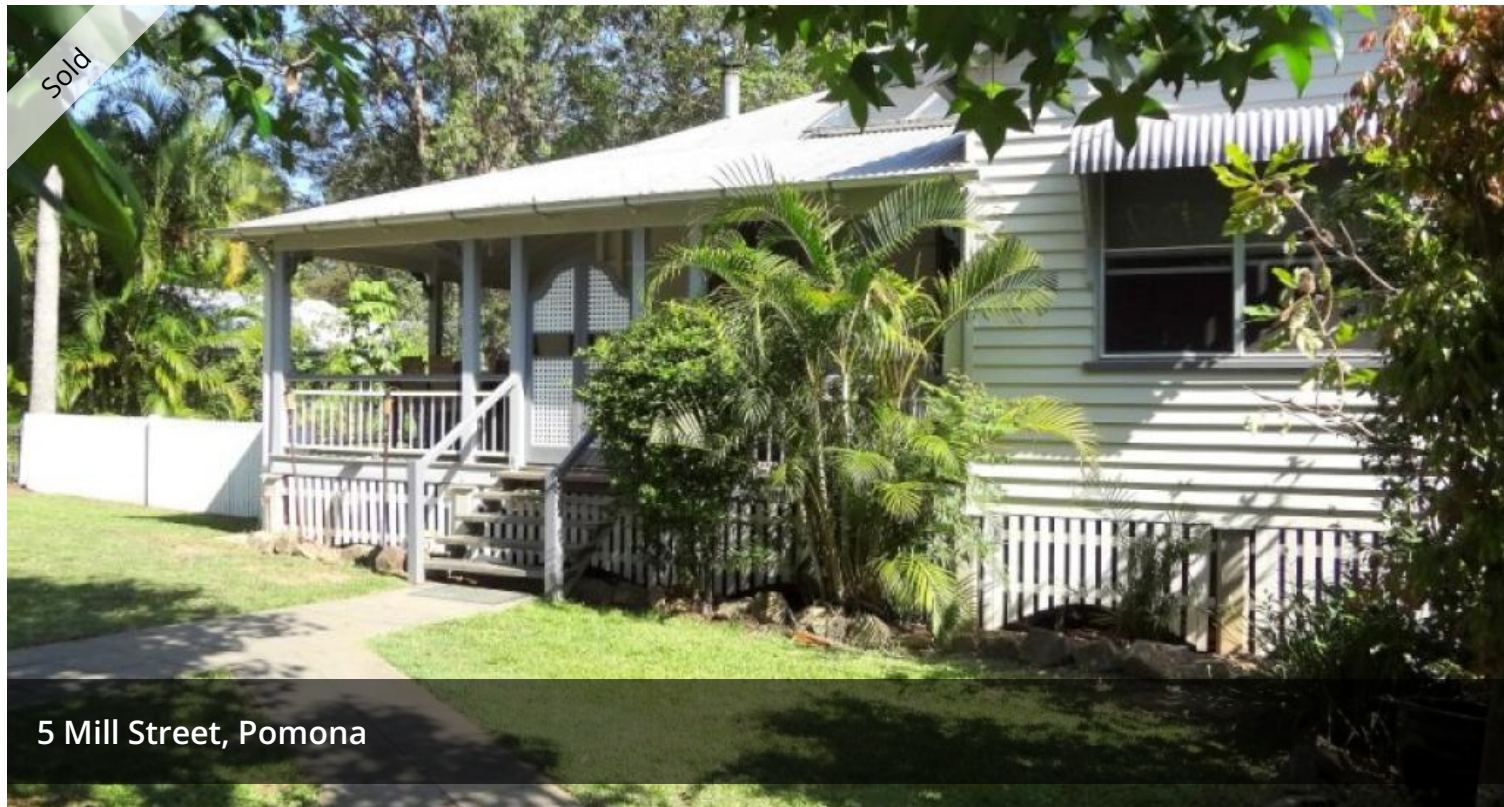
5 Mill Street, Pomona