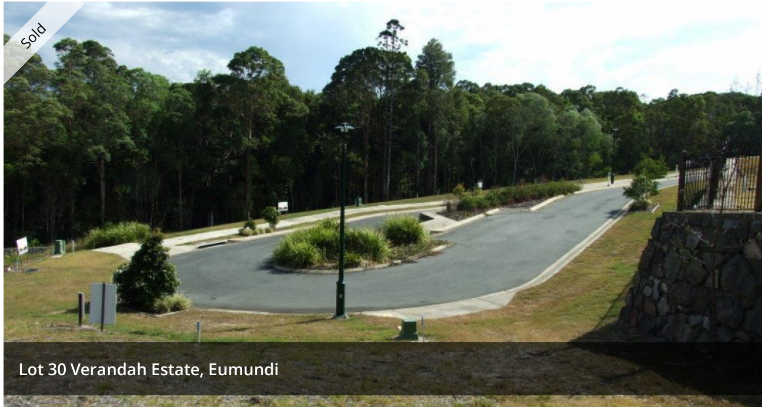
Lot 30 Verandah Estate, Eumundi