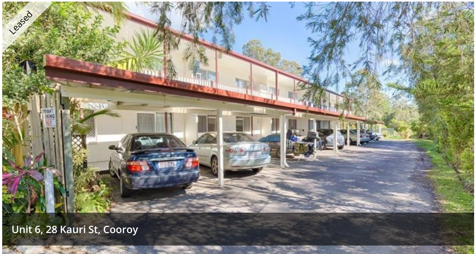
Unit 6, 28 Kauri St, Cooroy