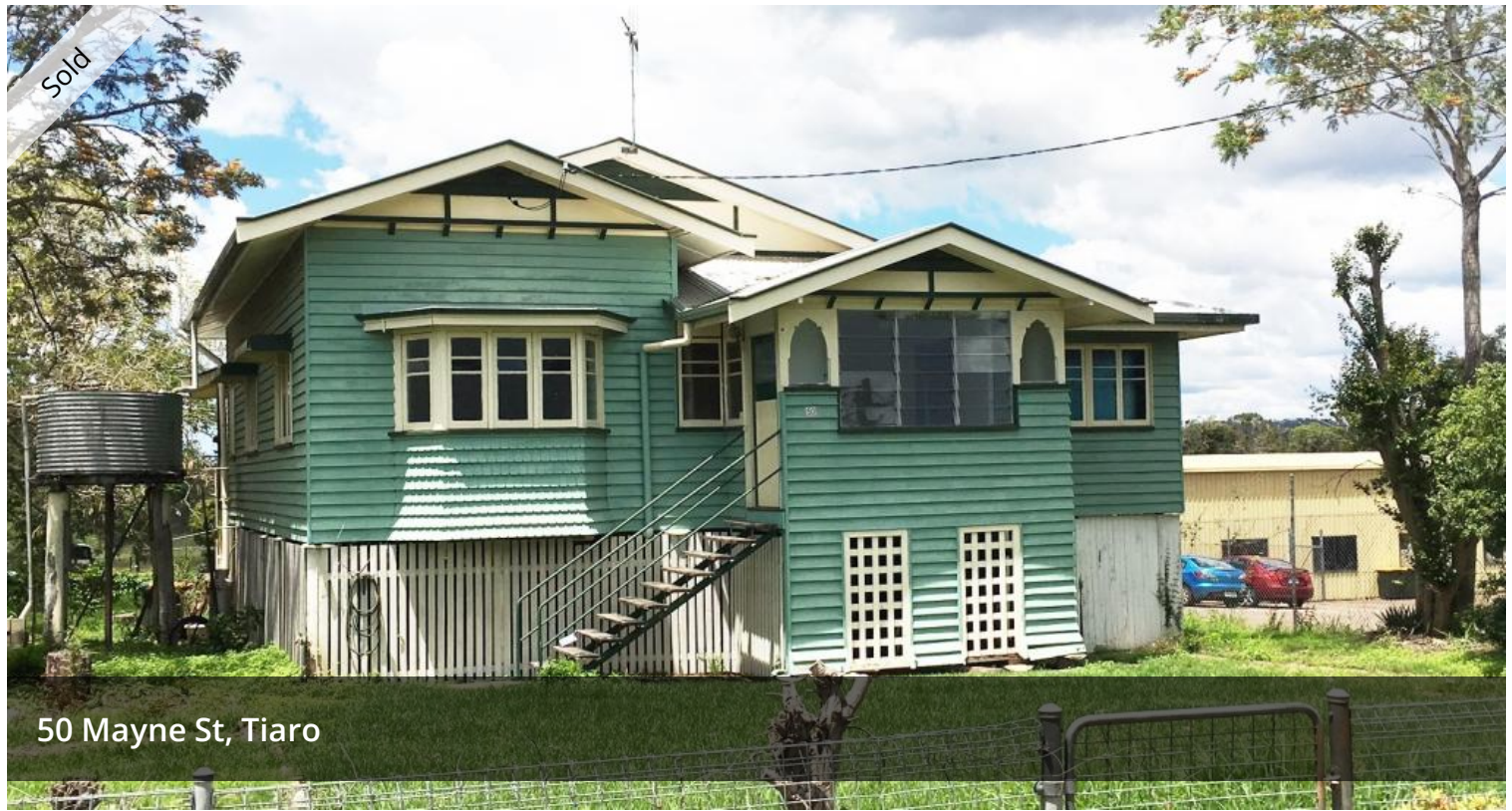
50 Mayne St, Tiaro