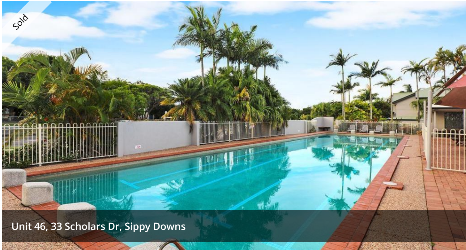
Unit 46, 33 Scholars Dr, Sippy Downs