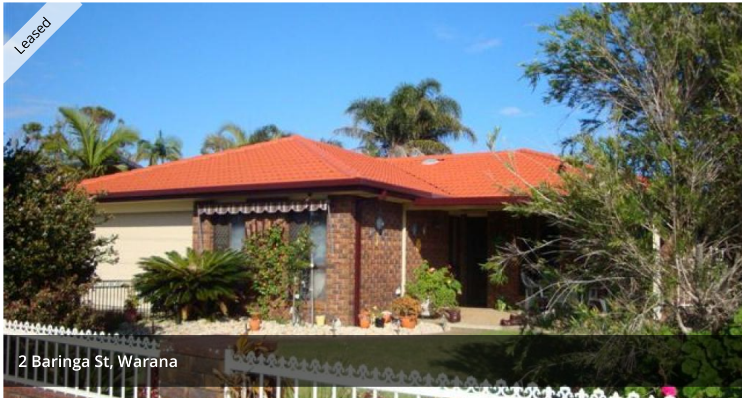
2 Baringa St, Warana