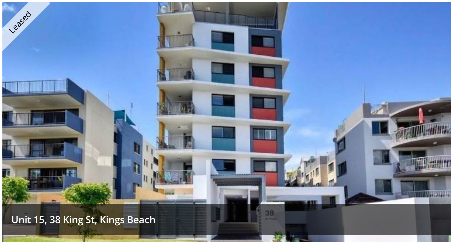
Unit 15, 38 King St, Kings Beach