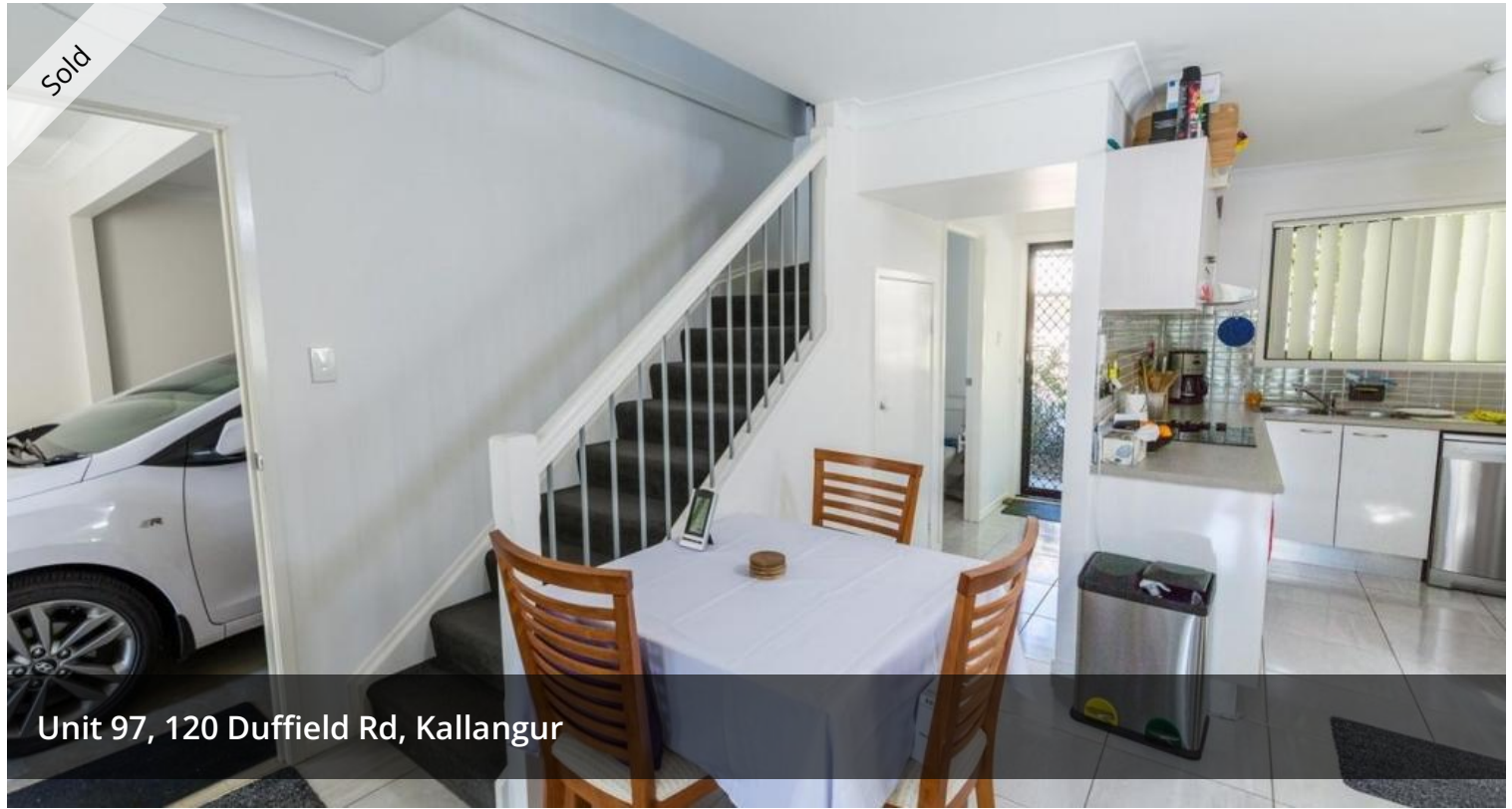
Unit 97, 120 Duffield Rd, Kallangur