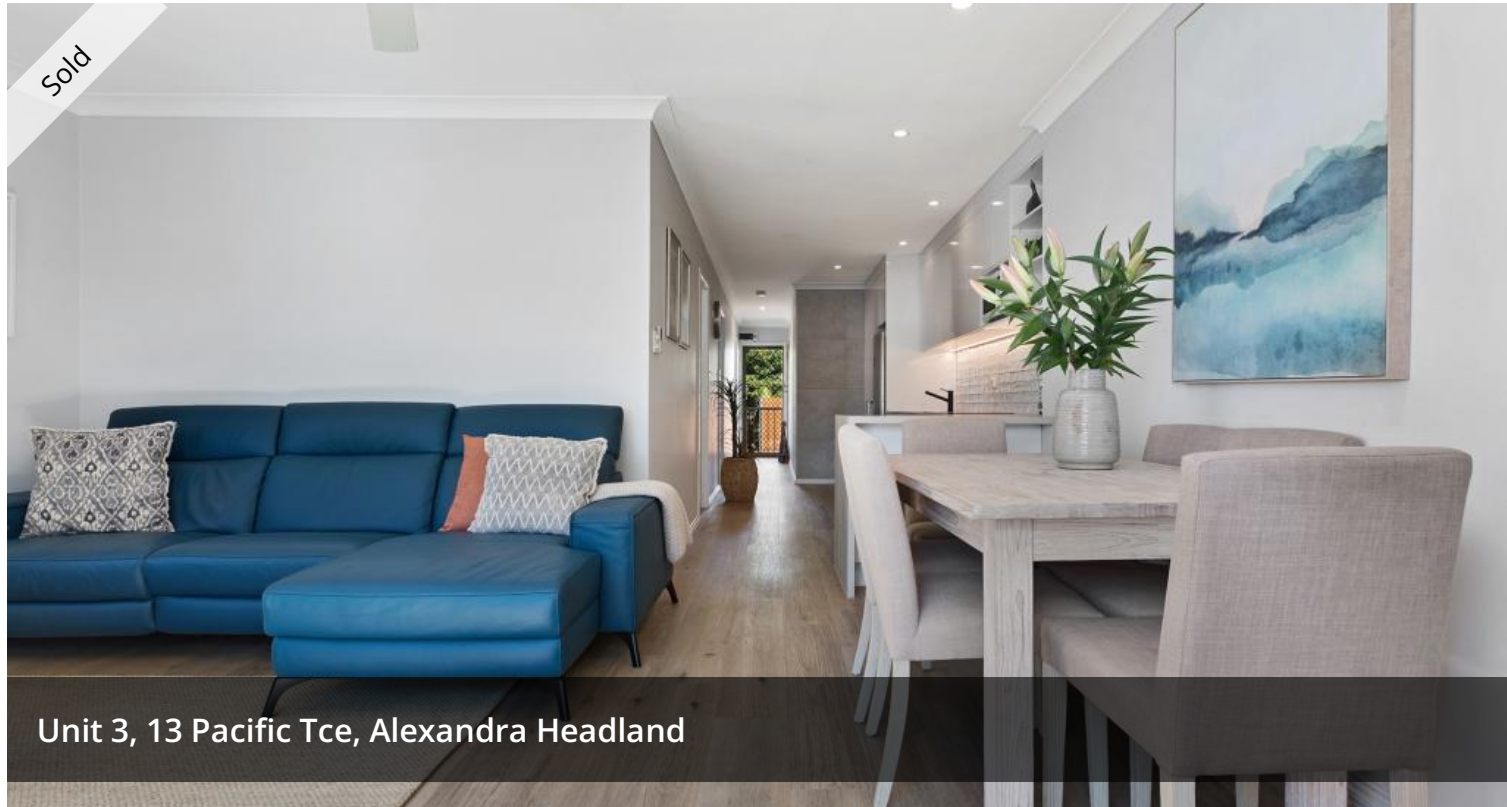
Unit 3, 13 Pacific Tce, Alexandra Headland