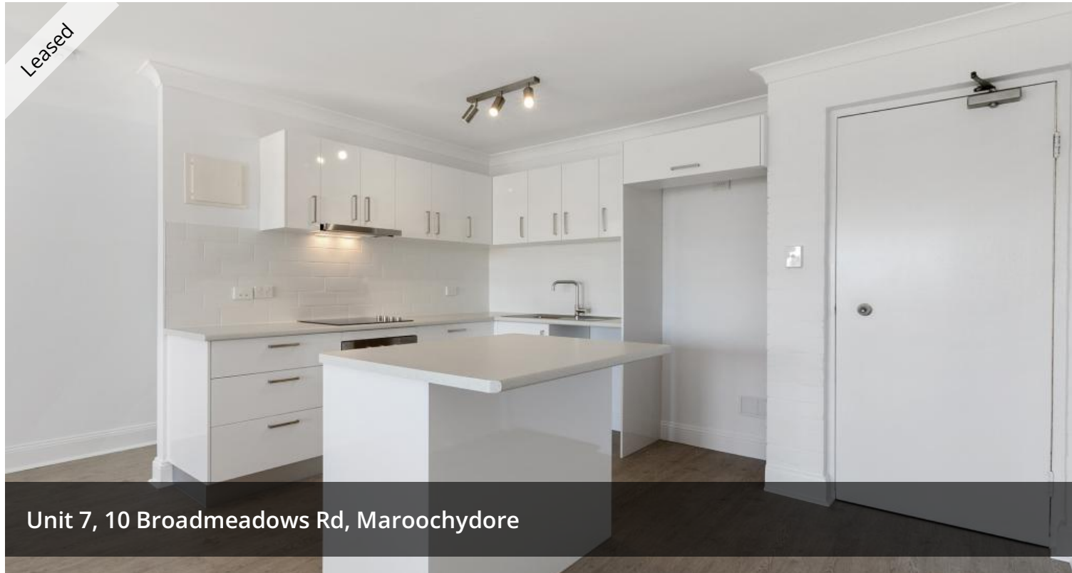
Unit 7, 10 Broadmeadows Rd, Maroochydore