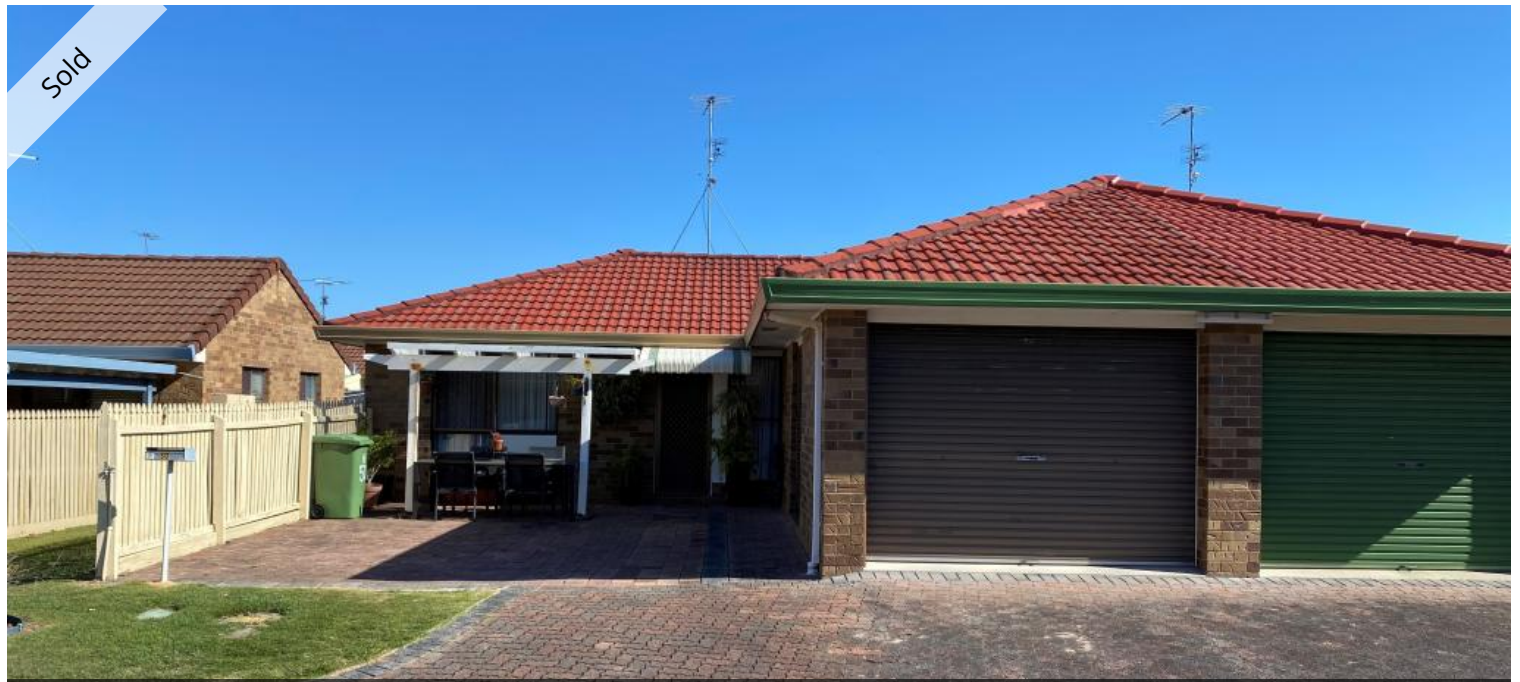
Unit 50, 2 Longwood St, Minyama