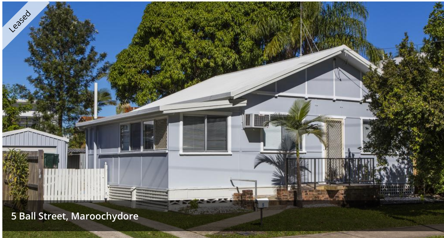
5 Ball Street, Maroochydore