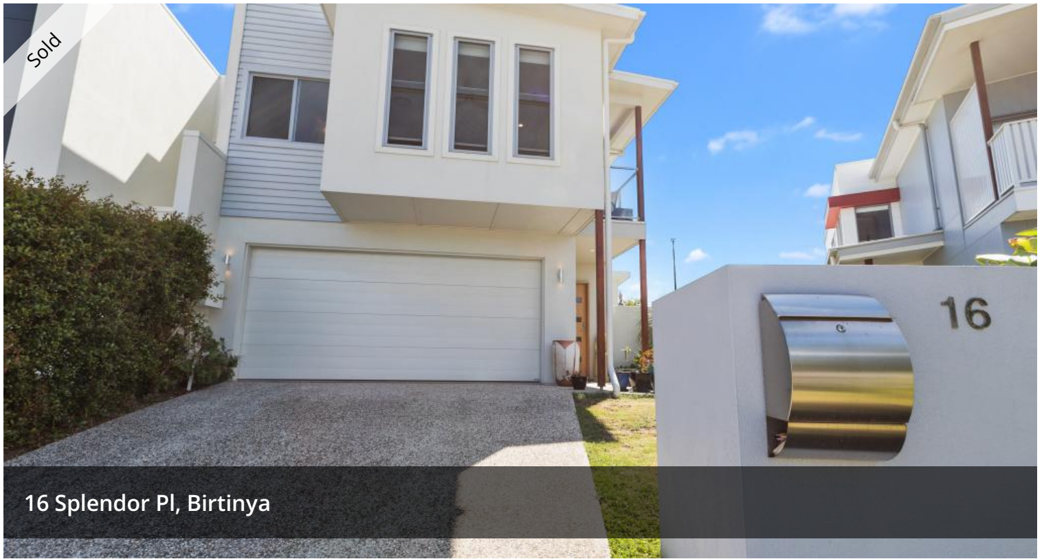
16 Splendor Pl, Birtinya