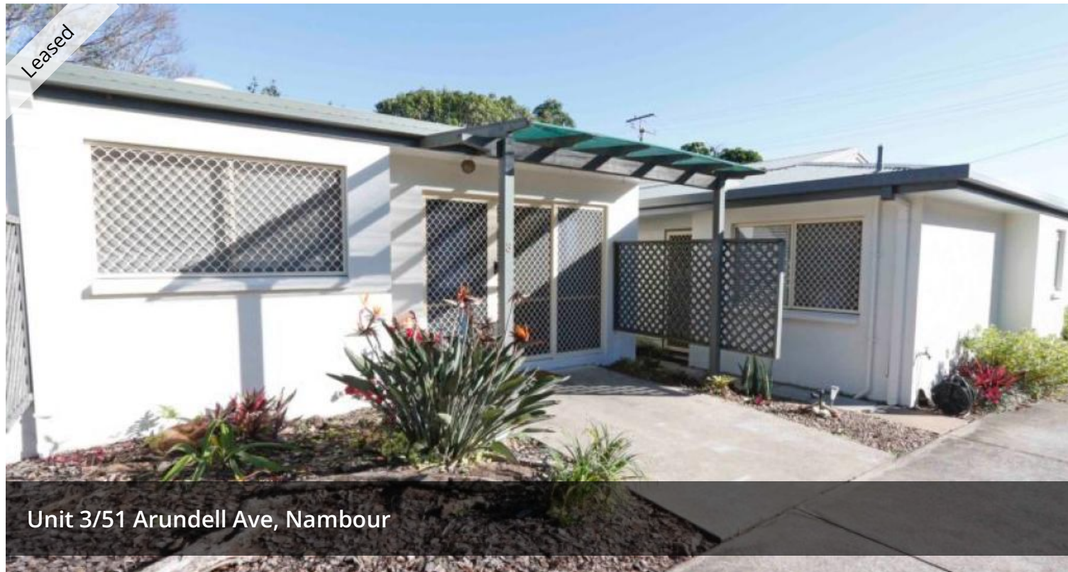
Unit 3/51 Arundell Ave, Nambour