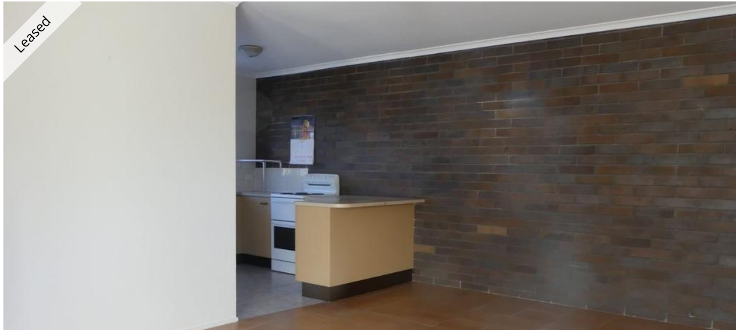
Unit 1, 14 Amanda Ave, Marcoola