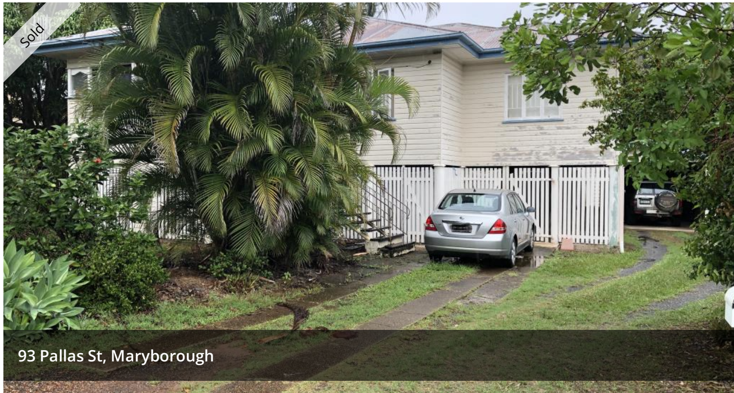
93 Pallas St, Maryborough