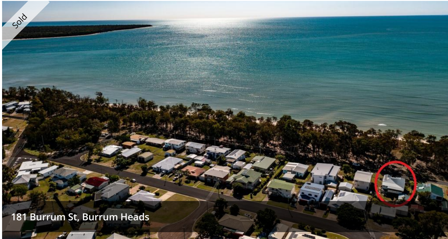
181 Burrum St, Burrum Heads