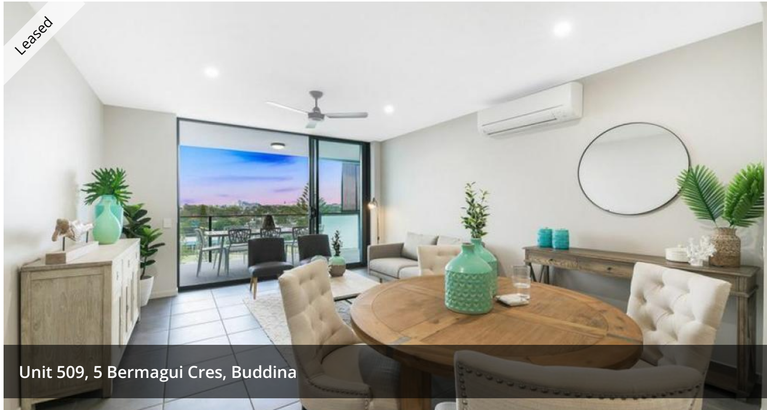
Unit 509, 5 Bermagui Cres, Buddina