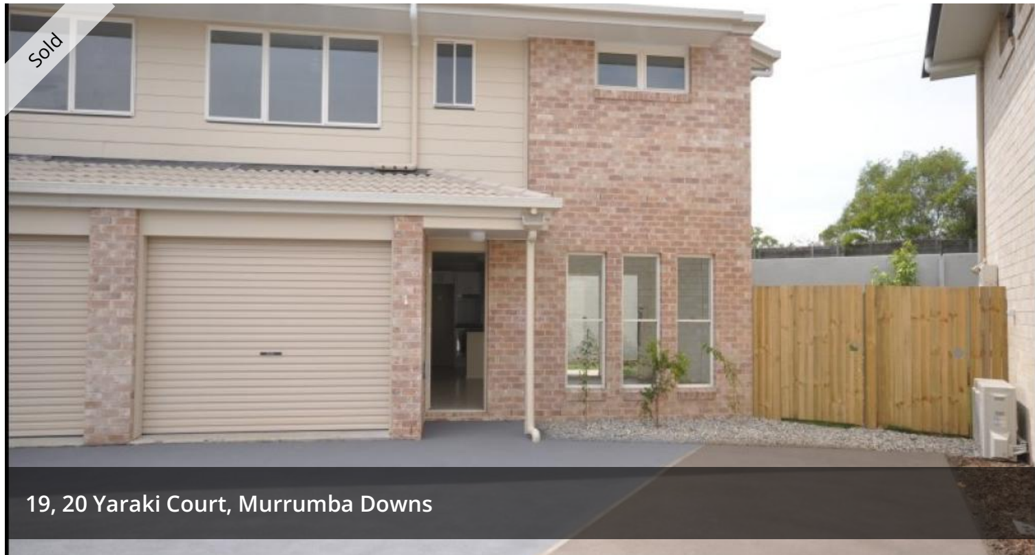
19, 20 Yarak Court, Murrumba Downs