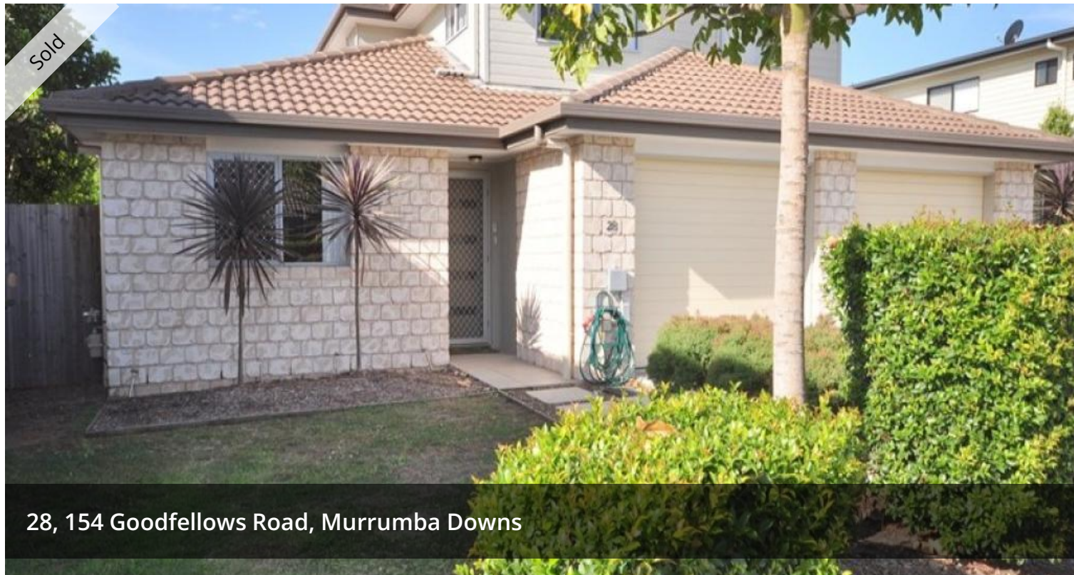
28, 154 Goodfellows Road, Murrumba Downs