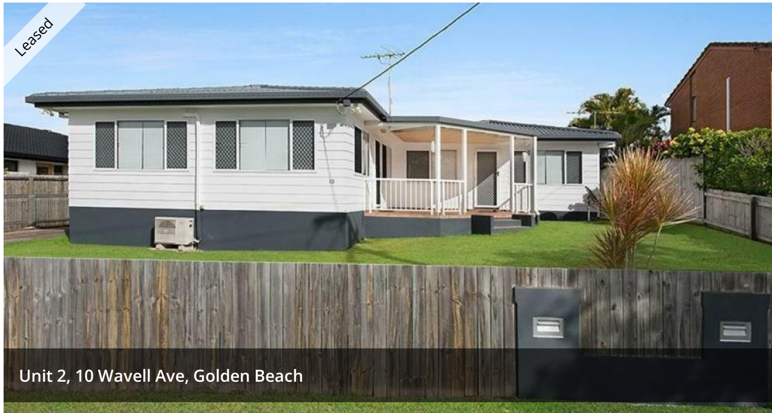
Unit 2, 10 Wavell Ave, Golden Beach