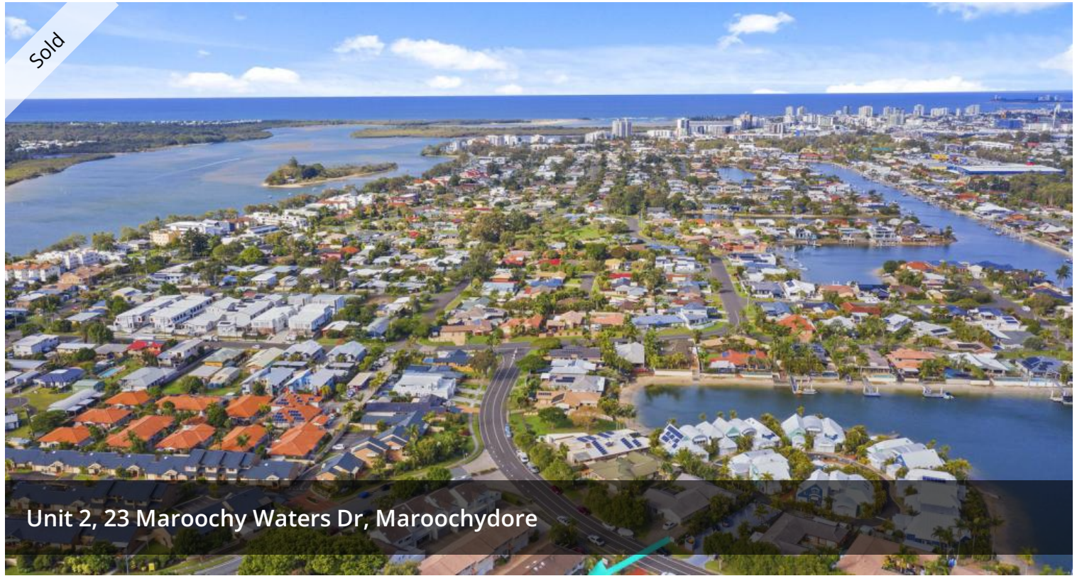
Unit 2, 23 Maroochy Waters Dr, Maroochydore