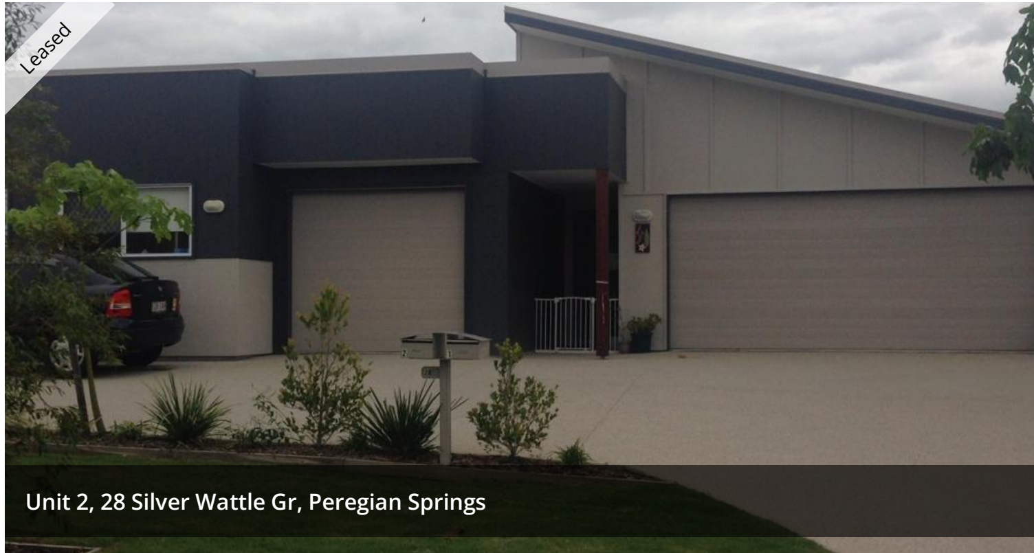
Unit 2, 28 Silver Wattle Gr, Peregian Springs