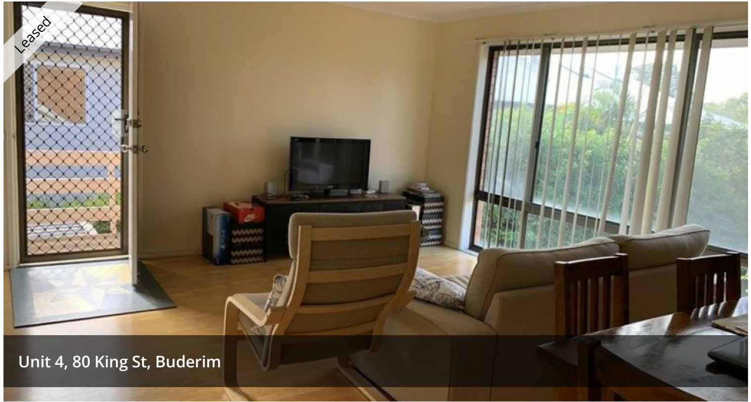
Unit 4, 80 King St, Buderim