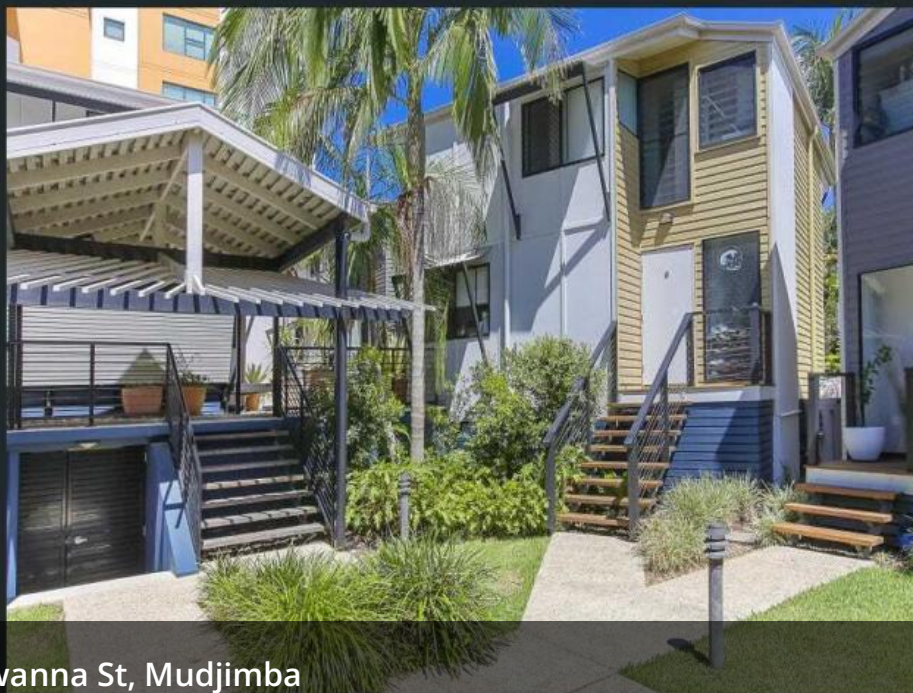
Unit 6, 10-12 Kawanna St, Mudjimba