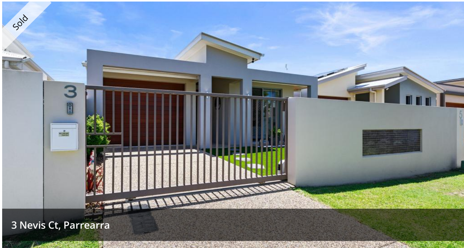
3 Nevis Ct, Parrearra