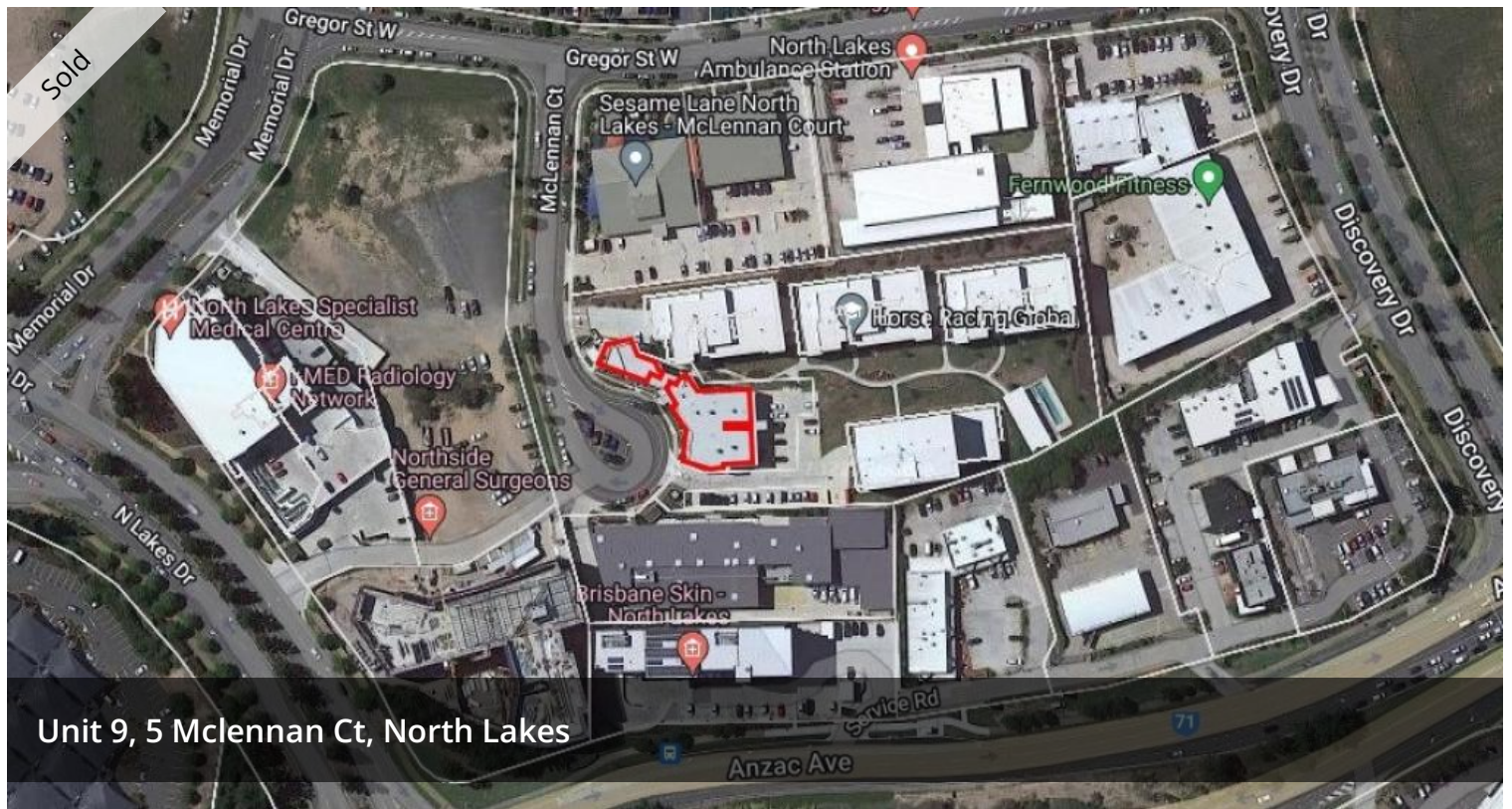
Unit 9, 5 McLennan Ct, North Lakes