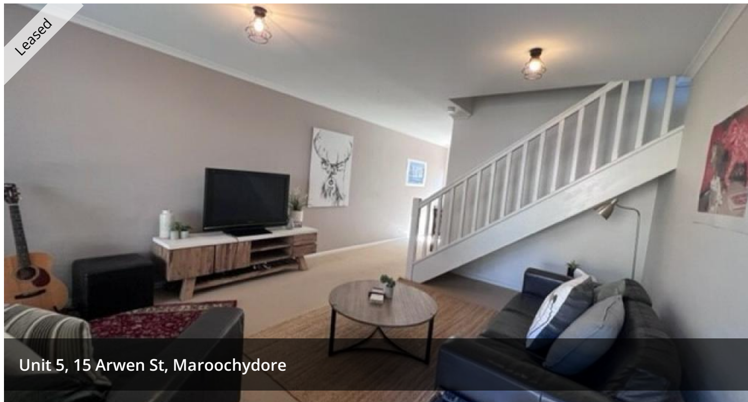
Unit 5, 15 Arwen St, Maroochydore