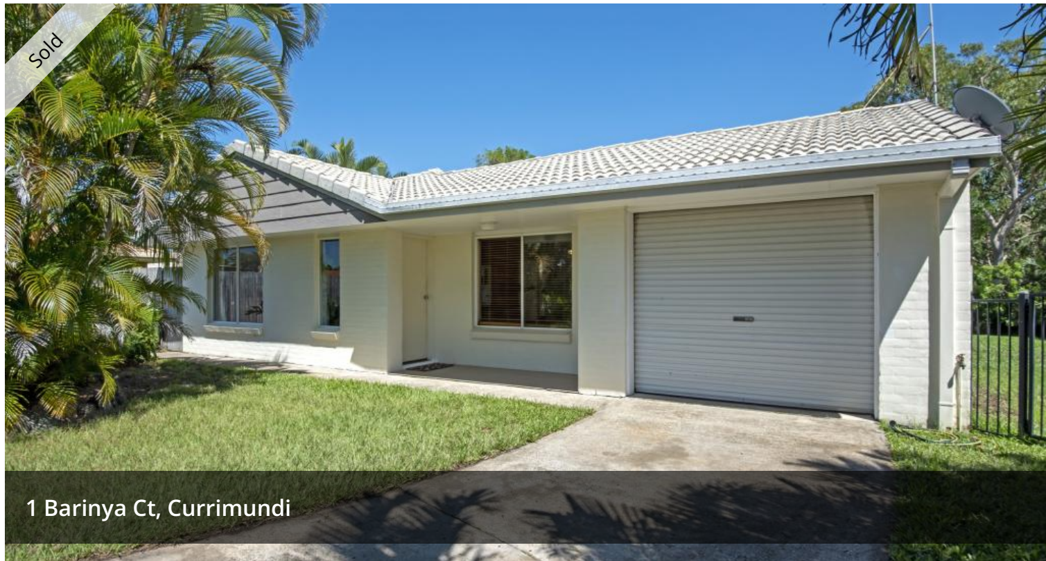
1 Barinya Ct, Currimundi