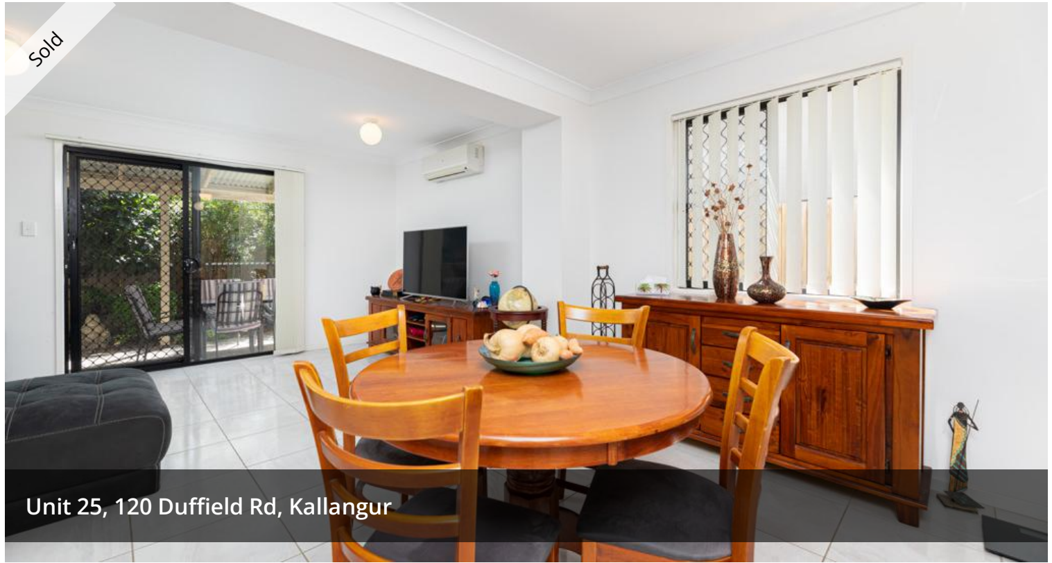
Unit 25, 120 Duffield Rd, Kallangur