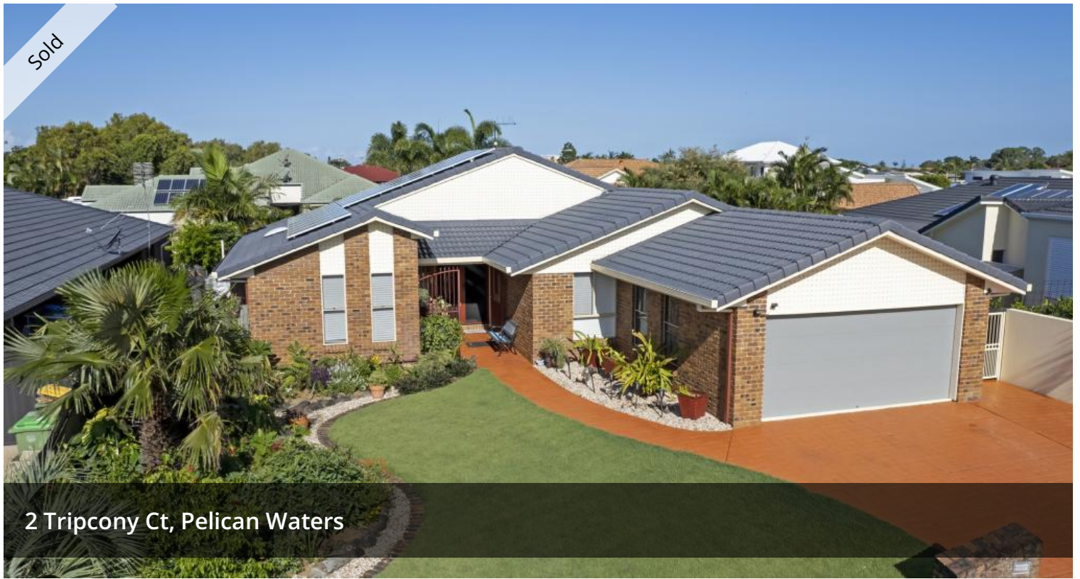
2 Tripcony Ct, Pelican Waters